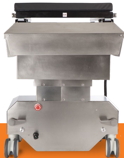
ISR foot end

Multi-caster/Multi-lock system for easy table positioning and transport from room-to-room