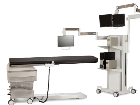
Aspect ISR shown with MDS mobile display and support system.